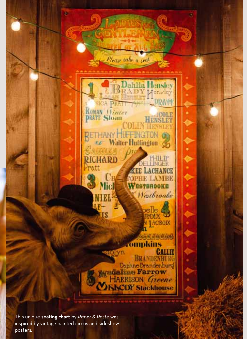
This unique seating chart by Paper & Poste was inspired by vintage painted circus and sideshow posters.