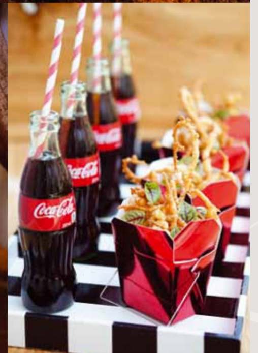
Above: Cotton candy pink popcorn in gold paper bags: Cake Opera Co., cakeoperaco.com Laser cut and etched oak wood popcorn label: Paper & Poste, paperandposte.ca Funnel cake with lemon icing sugar and red vein sorrel with Coca Cola Classic: oliverbonacini.com