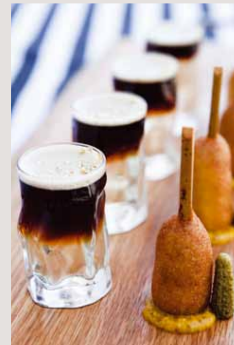
Corndogs with sweet mustard, little pickles and golden stout cocktail Guinness, oliverbonacini.com