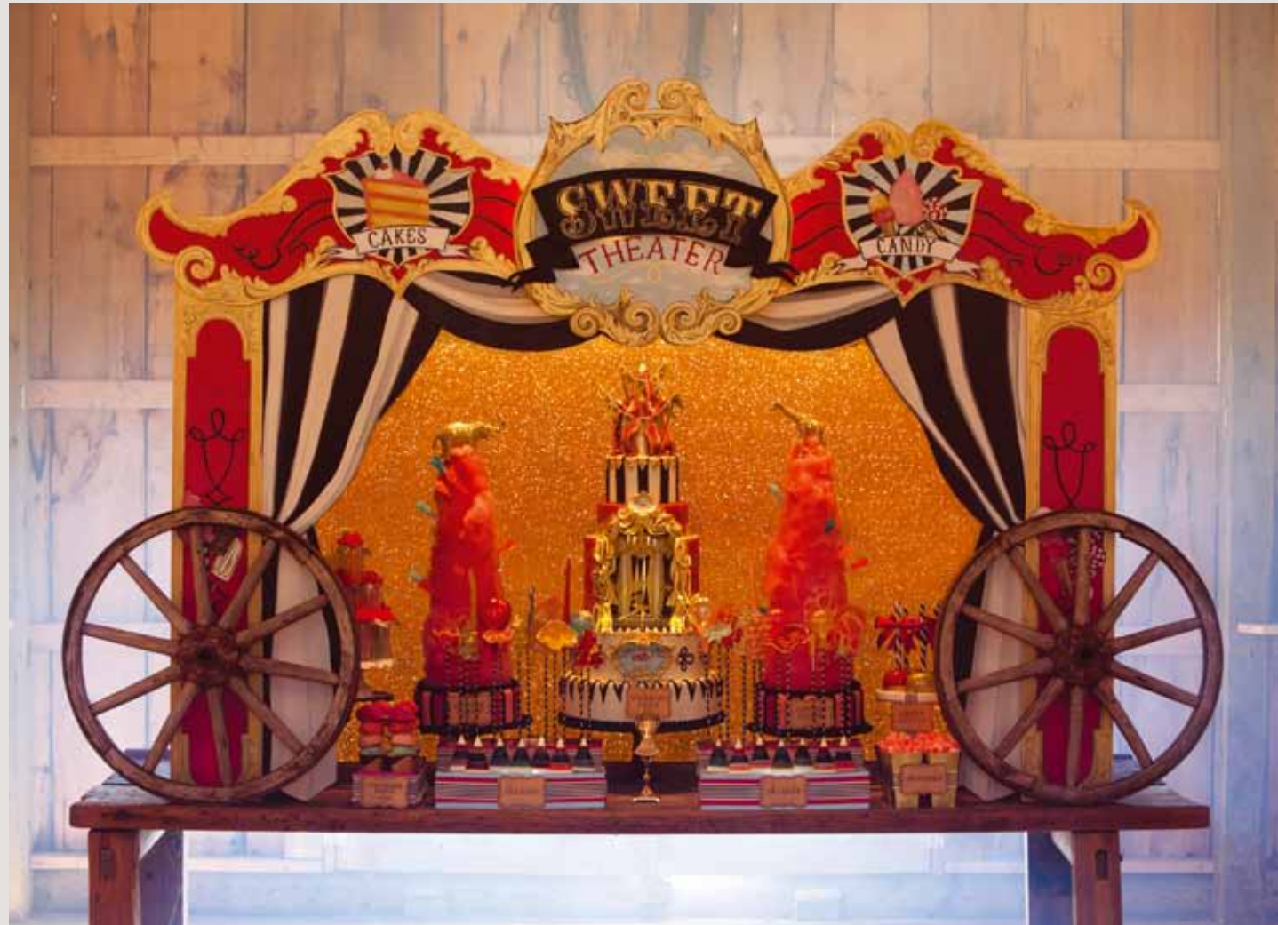
Six-tiered red velvet wedding cake featuring a sculpted theatre complete with glowing chandelier and stage lights, hand painted marquee and 24kt gold embellishments presented in a hand-crafted 'Sweet Theater.'