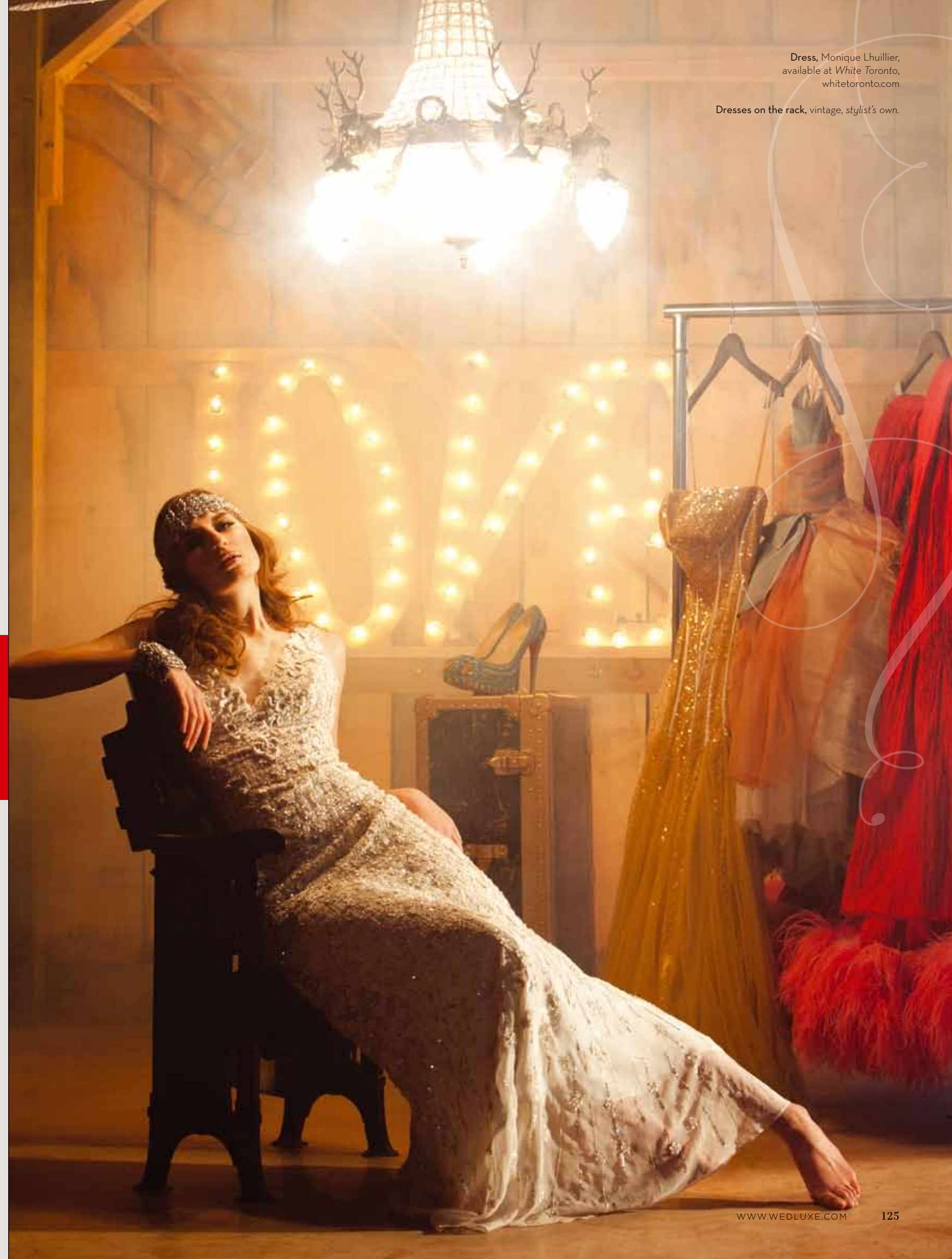
Dress, Monique Lhuillier, available at White Toronto, whitetoronto.com